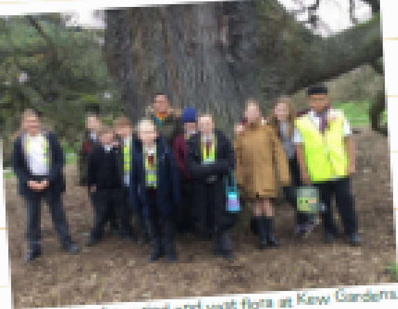
Exploring the varied and vast flora at Kew Gardens.