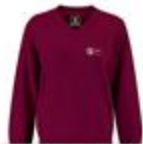
V-NECK SWEATSHIRT WITH SCHOOL LOGO

White buttoned shirt with a collar suitable for a tie is compulsory between November and March. These may be short or long sleeved.