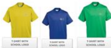
T-SHIRT WITH SCHOOL LOGO

Burgundy poloshirt, with or without logo, for interschool sports events