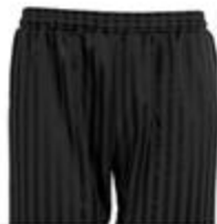
PLAIN SHADOW STRIPED SHORTS

grey/black socks grey trousers or shorts grey skirt black or grey tights