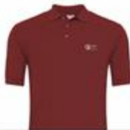
PE POLOSHIRT WITH SCHOOL LOGO

Burgundy poloshirt, with or without logo, for interschool sports events